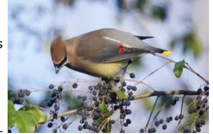
Cedar wax wing

Fill your yard and your life with interest!