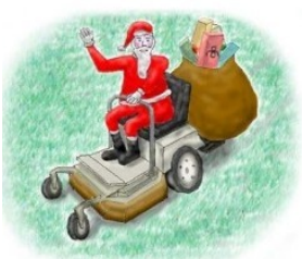
HAVE A MERRY MOWIN' CHRISTMAS!

Our offices will be closed Dec. 24-26 for Christmas. Have a great Holiday!